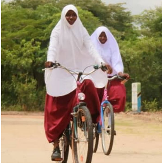
teenage girls ride to school in Tanzania: